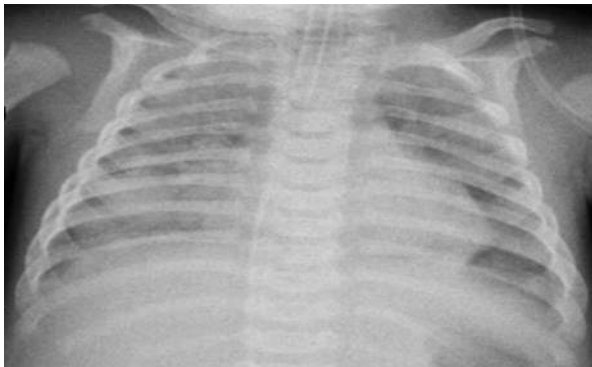
Figure 1 Chest X-ray of case 1.

Co-infection with RSV and Influenza A H1N1 virus was found. During her prolonged stay in PICU (111 days) she required MV due to ARDS with severe hypoxemia (Figure 3).